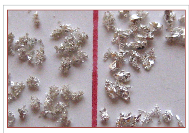
Notice how the rugged surface are of KAR silver crystals on the left side are larger than competitor and vendor E on the right side. (Red line is 0,5mm.)

Using KAR silver crystals will save substantial reduction in installed weight of silver or reactor and still achieve larger catalytic surface area.